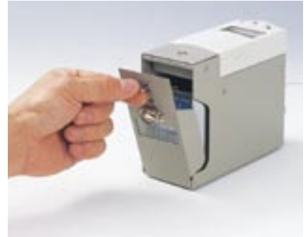
Lift the snap lock and open the sensor cover.