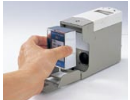
Remove the sensor unit and insert the new sensor unit. Close the sensor cover.